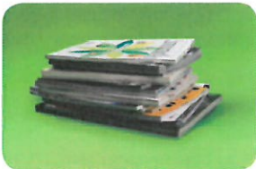
Magazines and catalogues