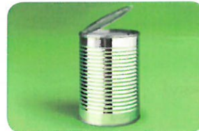
Steel food and beverage containers