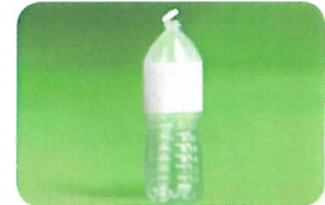
PET #1 plastic food and beverage containers