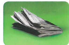
Newspapers and flyers

These are types of recyclable materials accepted in your recycling program: