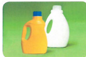
HDPE #2 plastic containers