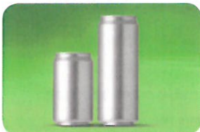
Aluminum food and beverage containers