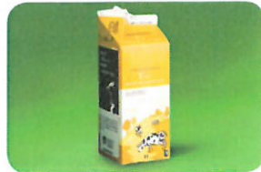
Gable top containers