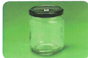
Glass food and beverage containers