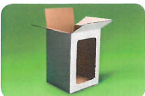
Residential corrugated cardboard