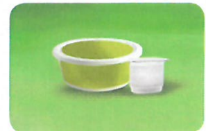
#4, #5 and #7 plastic containers